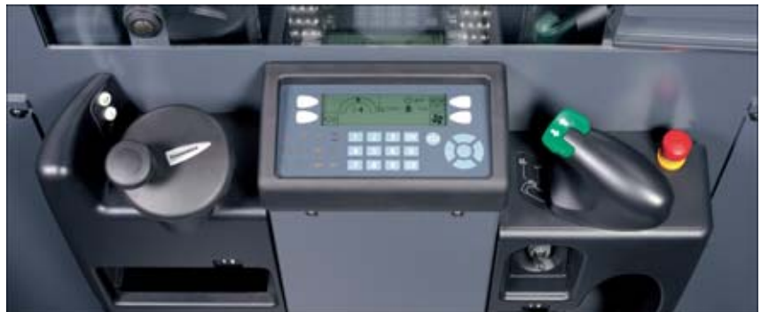
Controls, drive side