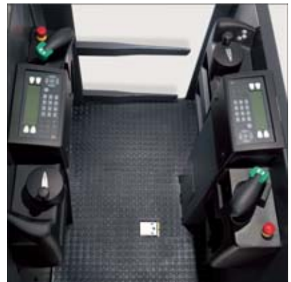
Controls, load side and drive side