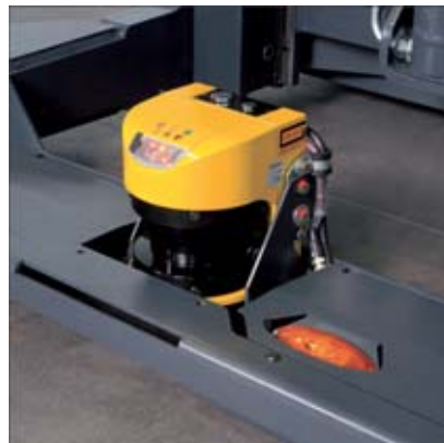
Jungheinrich personnel protection system