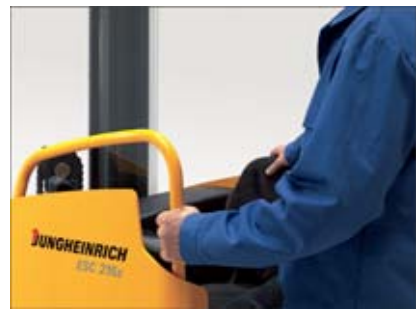
Grab handle for safe access and for the fitting of various options