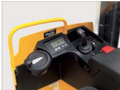
Ergonomic layout of all controls