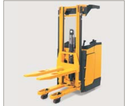
ESC Z13 with Initial Lift