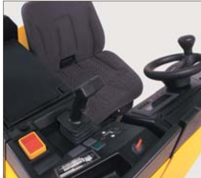
Ergonomic operating unit