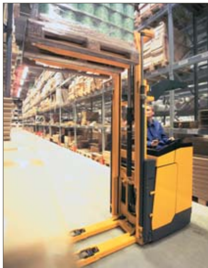
Ideal for utilisation in narrow working aisles