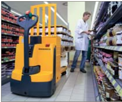
Back-friendly lift height with optimised vertical load guard