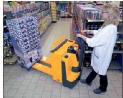
Application in the shops