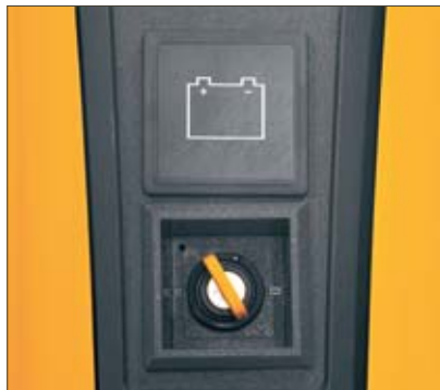
Combined discharge indicator with state of charge display

Sprung and cushioned support wheels linked via the torsion bar suspension