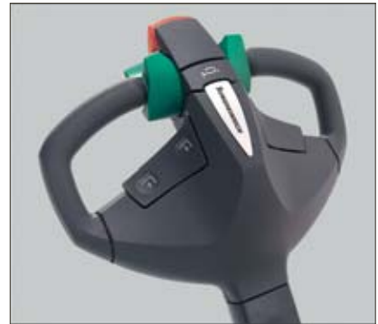
Ergonomic tiller head

sensor system which has IP 65 protection against water ingress.