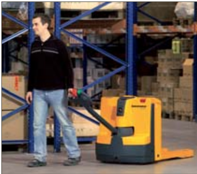
Powerful due to innovative 3-phase AC technology