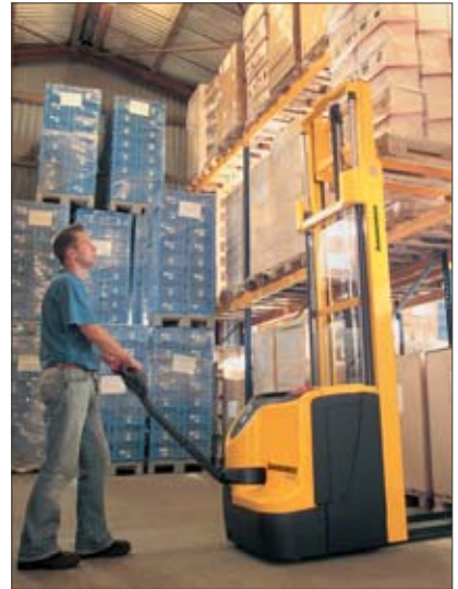
Excellent visibility through slim mast