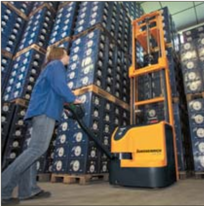
High residual capacities promote truck versatility