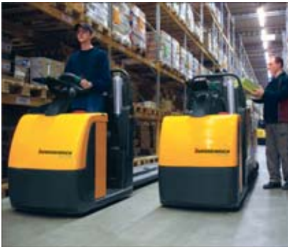
Comfortable operation and fast order picking