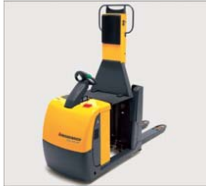
Order picking from the second rack-level with rising stand-on platform