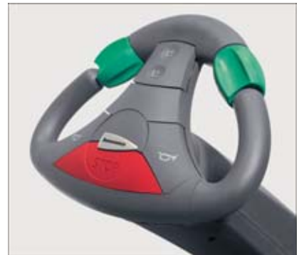
JetPilot – exclusive from Jungheinrich