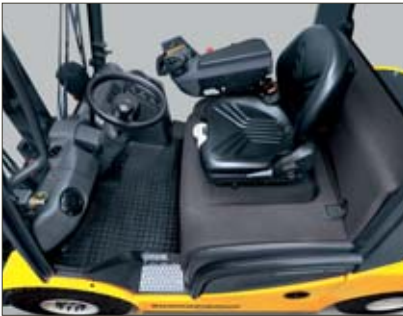
Comfortable and productivity inspiring workplace